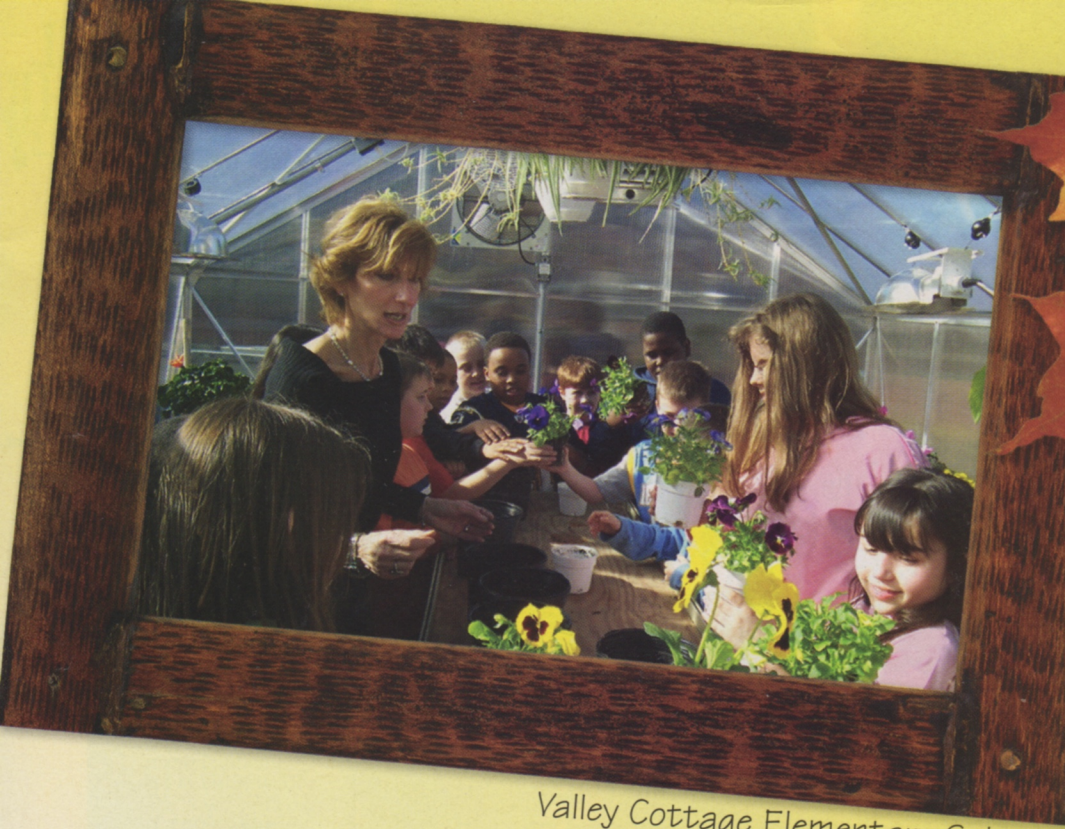
Valley Cottage Elementary School