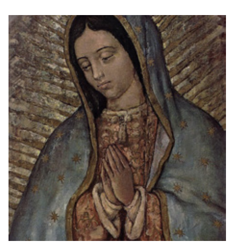
THURSDAY, NOVEMBER 17 Pointillism & Sacred Music Meditation in the Virgin of Guadalupe: Images in Colonial Mexico Galleries