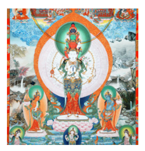
THURSDAY, DECEMBER 15 Yoga Meditation in Sacred Realms

Tickets and More Information Available at www.bowers.org or 714.567.3677