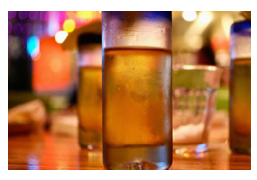
THURSDAY, NOVEMBER 3 Dia de la Tequila! This Day of the Dead Celebration will feature tequila tasting, art-making, viewing of Virgin of Guadalupe: Images in Colonial Mexico and more!

Still growing strong, Thirsty First Thursday program is a great way to wind down the work week with a drink, live music and art surrounded by the beauty of the Bowers Museum. This year we're adding a Parent's Night Out opportunity at Kidseum along with each Thirsty Thursday program, providing parents a well-deserved midweek break while their kids enjoy arts and crafts at Kidseum